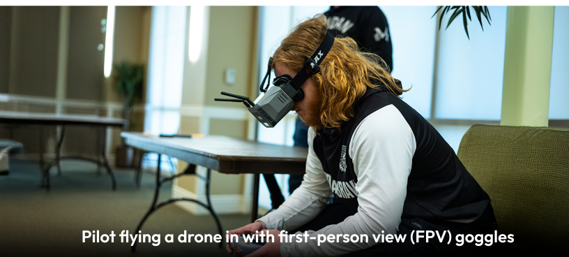
Pilot flying a drone in with first-person view (FPV) goggles